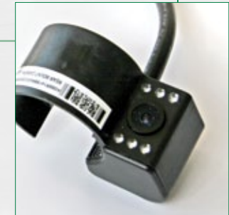
Rear-Mounted, Fixed Day/Night Camera System

Keep watch behind the robot. Easily installs on the rear handle. Six infrared LEDs provide night-time illumination. No configuration necessary.