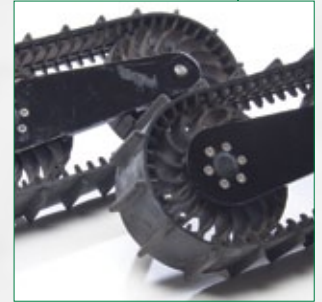
Flipper Mobility Upgrade (includes two flippers for robot)

Allows the robot to go up and down most standard stairs and over obstacles. You can even right the robot if it flips over. Part # 4188812