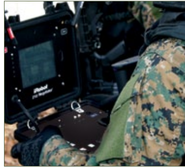
The intuitive Operator Control Unit (OCU) for 210 Negotiator facilitates fast training and easy operation in the field.

Media Contact 781.430.3182 publicrelations@irobot.com