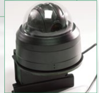
Pan Tilt Zoom Color Camera System

Continuous 360-degree pan and 180-degree tilt for enhanced "eyes on." 100X Zoom, Auto Iris, Auto Focus. Easy to install. No configuration necessary.